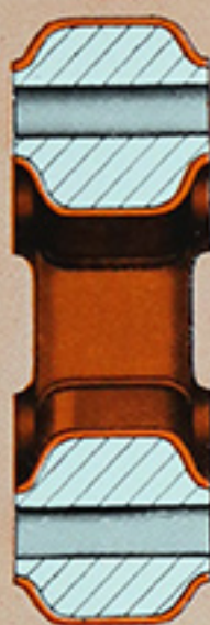
SECTION THROUGH ROTOFLEX COUPLING